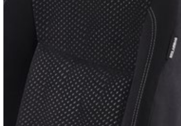
Interior Cloth seat trim.

† Towing capacity is subject to towbar/towball capacity and vehicle laden condition. The capacity may be reduced if a non genuine Nissan towbar is fitted. The permitted download is directly related to the laden mass of vehicle.