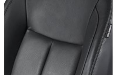
Interior Leather accented seat trim ‡ (Optional on ST-X).

# Gross Combined Mass with braked trailer.