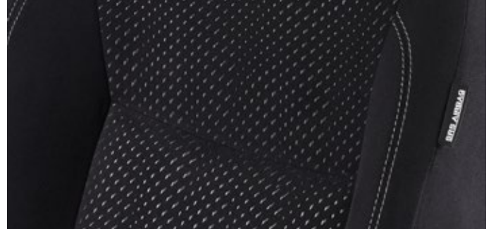
Interior Cloth seat trim.

my nissan our comprehensive ownership experience