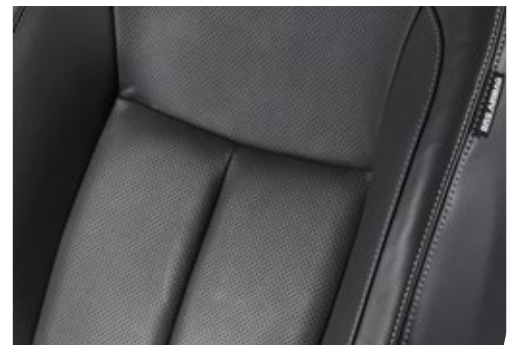
Interior Leather accented seat trim † (Optional on ST-X).

my nissan our comprehensive ownership experience