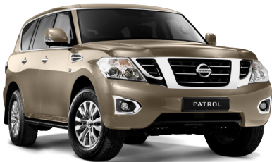
Desert Dune (HAE)