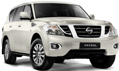
Ivory Pearl (QAB)