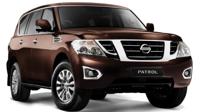
Rich Brown (CAS)

In some cases, the printed colours may vary from the actual paint colours.