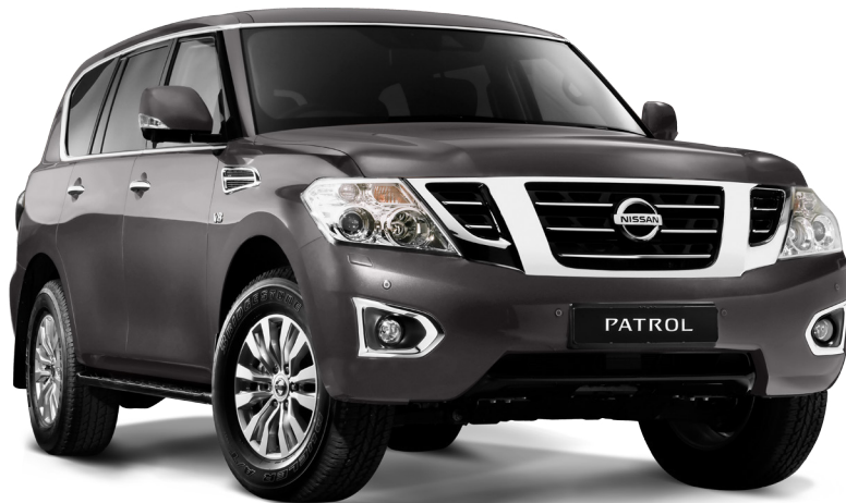
Gun Metallic (KAD)