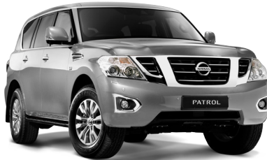
Sheer Silver (K23)